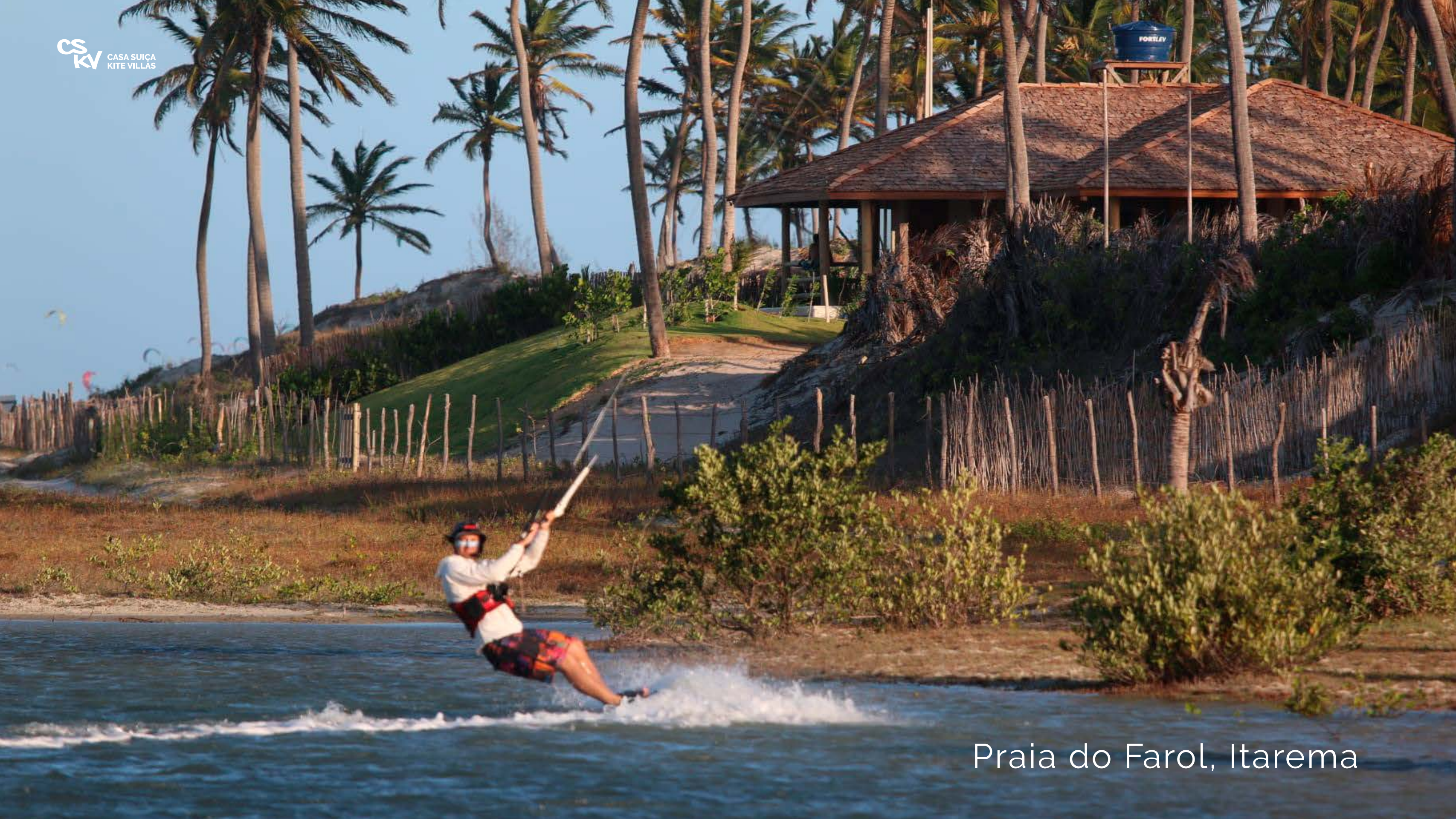
Praia do Farol, Itarema