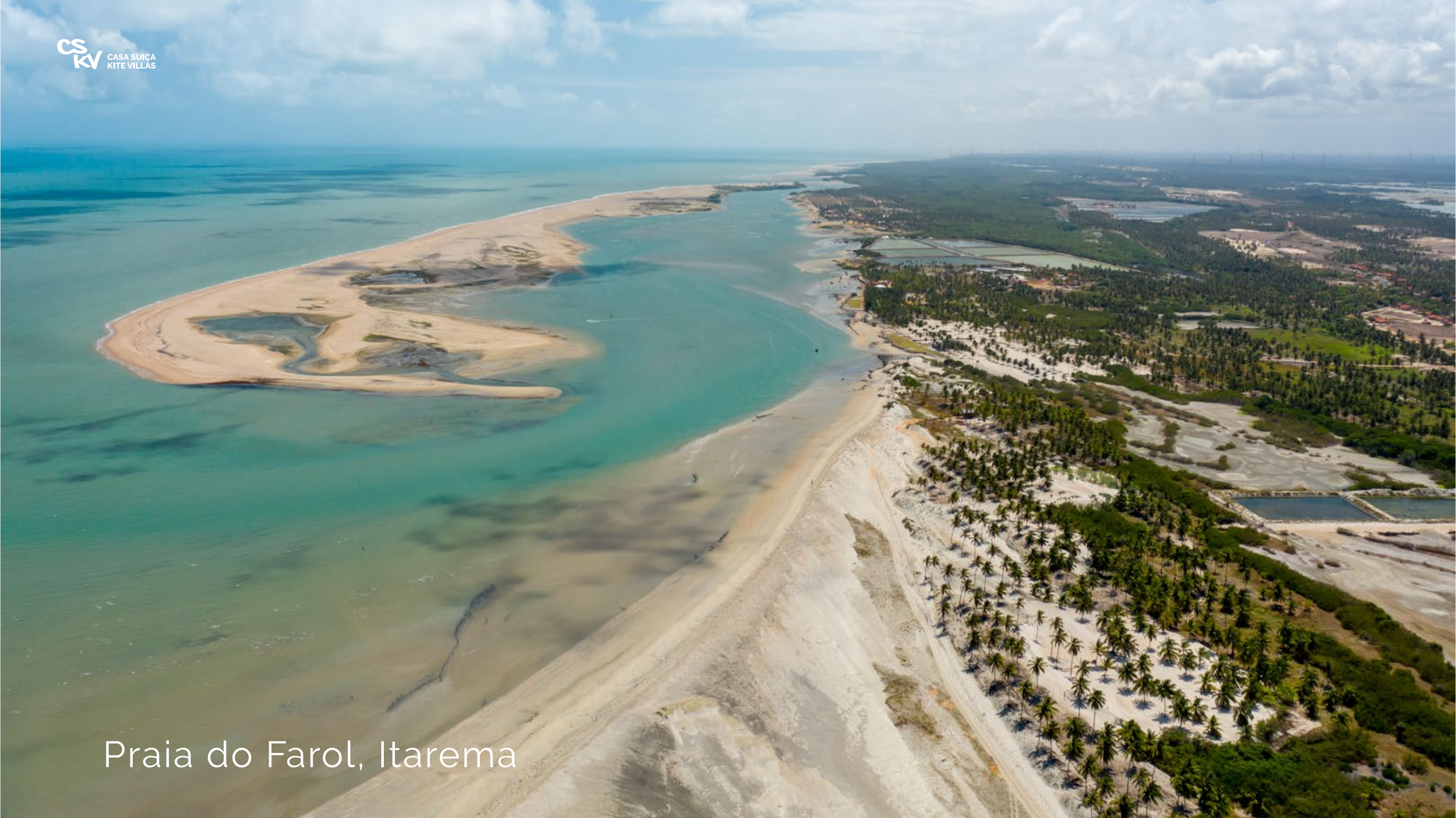
Praia do Farol, Itarema